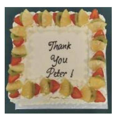
And don't miss this!...