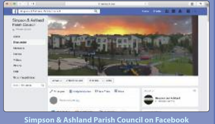
Are you a Facebook user? Become a friend of Simpson & Ashland on Facebook. Stay in touch, comment on and ask questions about what is going on in your neighbourhood. We also tweet! @SimpsonAshland