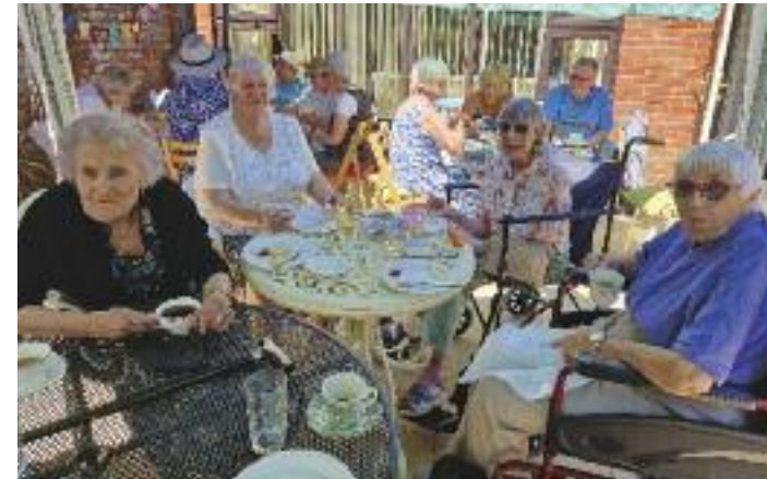
Enjoying a cream tea