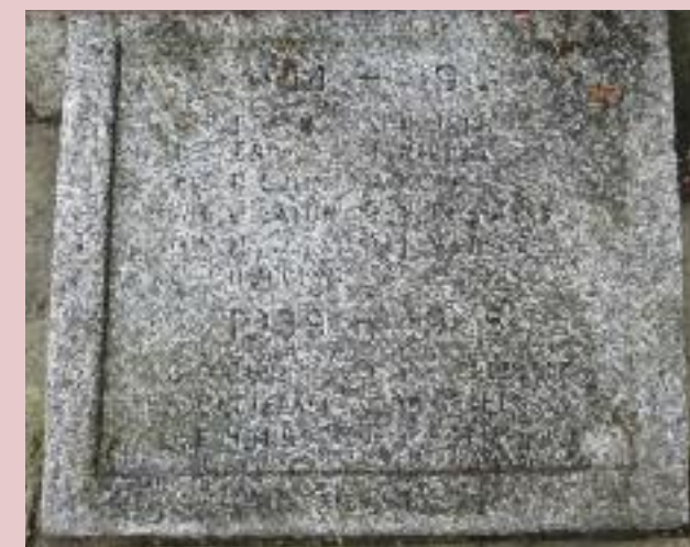
Simpson war memorial – before