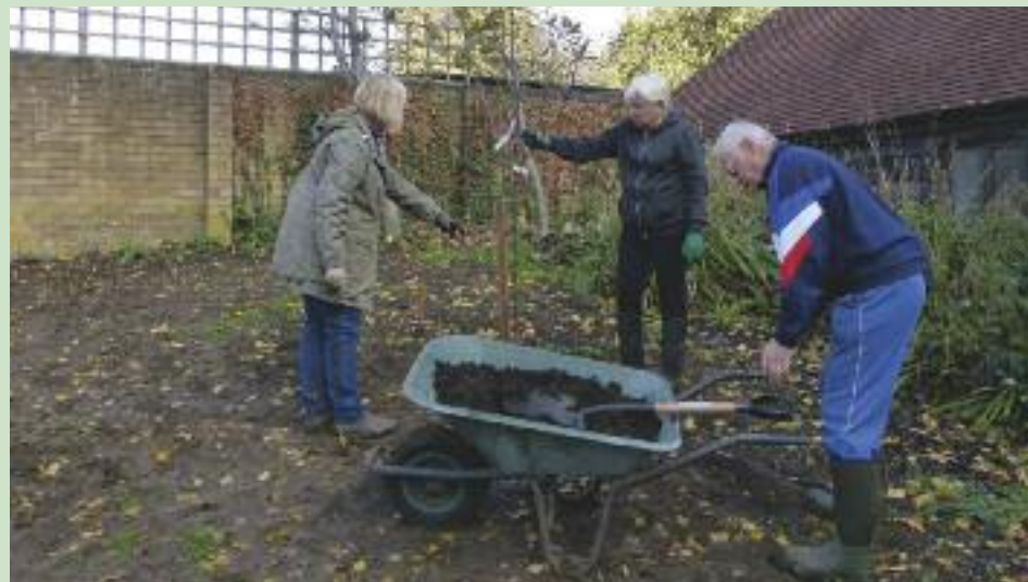
Planting an apple tree