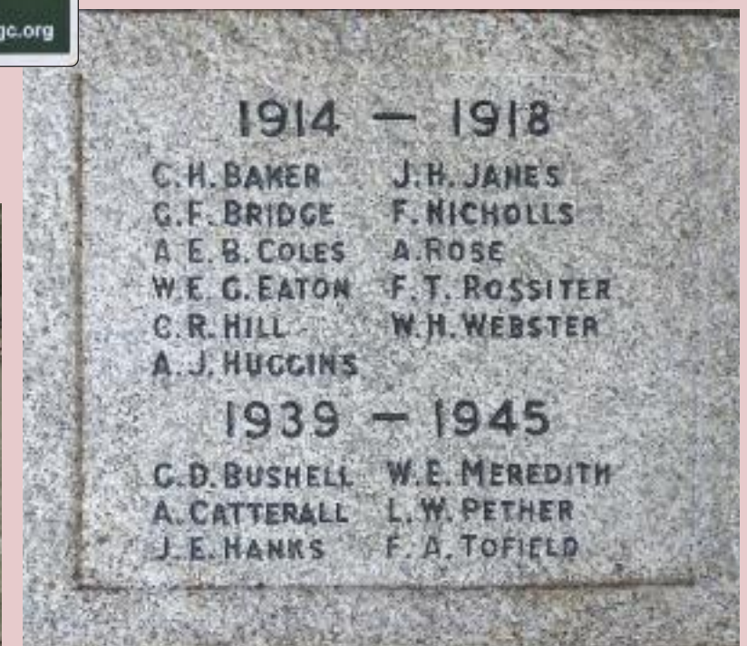
Simpson war memorial – after

Bring and share buffet Collection for Church Funds