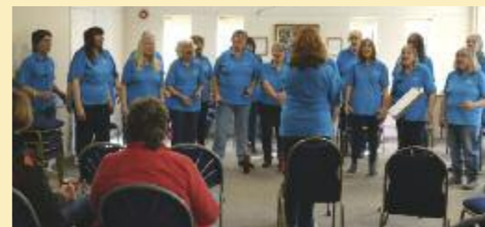
Junction 14 choir at April's Singing for everyone session